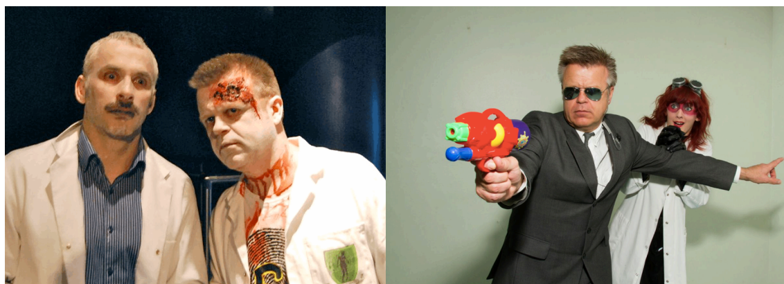
Figure 1: Zombie Science and Superhero Science .

When rewriting the problem sessions, I decided to focus on three of the most important, but sometimes neglected, aspects of bioscience teaching, data-analysis, problem-solving and experimental design. I took inspiration from several sources. My favourite childhood book was You Are the Ref! , a comic book approach to learning the rules of football using various plausible (and some rather less plausible) short stories. I've also undertaken lots of Public Engagement work with Glasgow Science Centre (REF1) and have become a great fan of their Inspire & Challenge approach. In addition, I've spent much of the last ten years working with Time-Tastical Productions on our Wellcome Trust funded comedy science shows Zombie Science (REF2) and Superhero Science (REF3). We use a storytelling approach to engage children, teenagers and young adults. Images from the shows, which have been seen by 80,000 and 20,000 people respectively, are shown below (see figure 1).