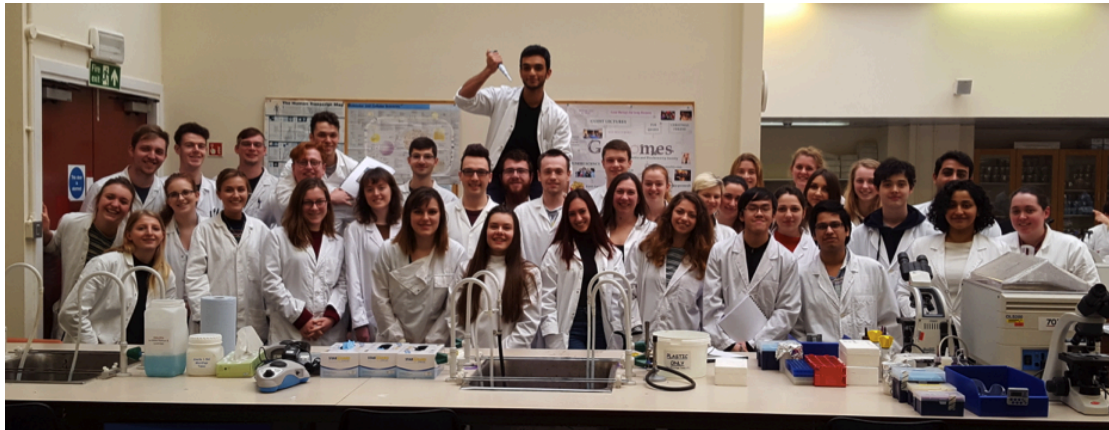
Figure 2: University of Glasgow Genetics: Class of 2018.

Around that time we hosted a Women in Science Café Scientifique in Glasgow. Biology is of course unusual among the STEM subjects in that it has no problem in attracting girls to study the subject. Indeed, it's not unusual for 75% of our genetics students to be female (see figure 2). However, this is not the case with senior faculty positions, reflecting issues of retention and progression, and leading to a lack of senior female role models. Having a teenage son and daughter really brings this into focus. Not only do I want my daughter to have the same opportunities as my son, I also want her to believe she has those same opportunities (REF4). So all the problem-solving scenarios have strong and successful female role models. All senior researchers, all professors, are female. Women also play many other key roles, such as the early nineteenth-century pioneering Dutch explorer Captain Faye Matt Laast, whose achievements are rediscovered and celebrated in The Laast Eagles of Laast Island .